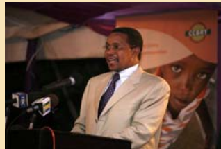
H.E. President Dr. Jakaya Mrisho Kikwete speaking at the CCBRT celebration event.

At a major event organised by CCBRT on 11th June in Dar es Salaam, Tanzania's President Dr. Jakaya Mrisho Kikwete thanked the corporate community for supporting the planned new maternity hospital to be built in a public-private partnership between CCBRT and the