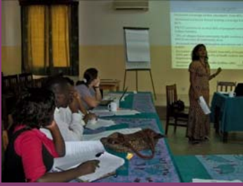
Journalists learning more about maternal health issues during a training session at CCBRT.