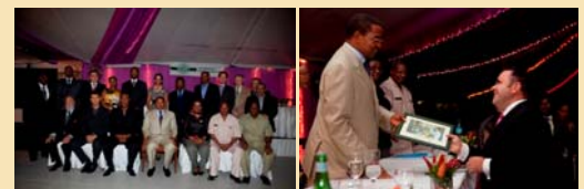
Corporate representatives with H.E. President Kikwete.

make motherhood safer. It is well known that a productive society depends on a healthy society and to have a new high quality maternity hospital here in Dar es Salaam will be of great benefit to all our families and employees in the years to come."