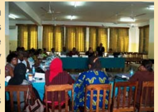
Stakeholders in reproductive and child health attending a meeting at CCBRT.

Representatives from UNFPA, UNICEF, Abbott Fund, Engender Health, Women ' s Dignity, and Jhpiego also joined the meeting.