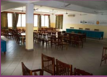
The existing space to be converted into a new training centre.